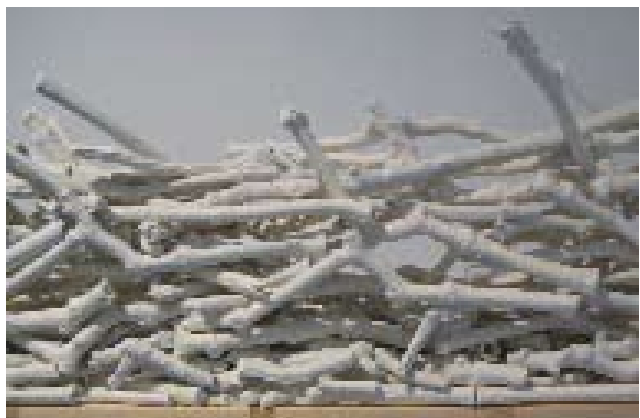
Reach by Benjamin Clore